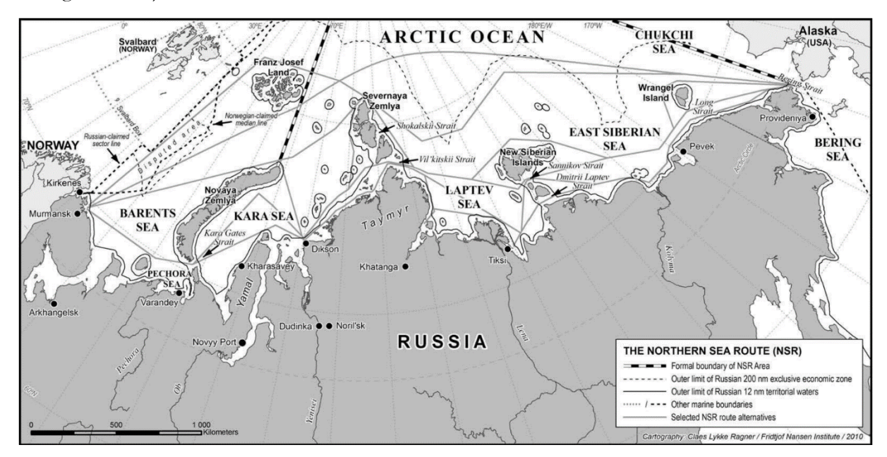
Figure 1: Northern Sea Route (Brubaker & Ragner, 2010).

The first review of Arctic shipping was provided by the "Arctic Council's Arctic Marine Shipping Assessment" (AMSA) using vessel traffic data of the Arctic countries for 2004 (AMSA, 2009). This assessment aimed to identify the vessel traffic in the Arctic and to determine the potential environmental impacts of maritime activities in the region (Gunnarson, 2021). With the establishment of the Russian Northern Sea Route Administration (NSRA) in 2013, studies on maritime traffic along the Russian Arctic coast have increased. Russia determined the definitions of the NSR and its sea borders in national legislation with the NSRA and supported the preparation of the Polar Code (Todorov, 2021). Figure 1 shows the available routes of the NSR, Russian exclusive economic zone limit, Russian territorial waters and other marine boundaries (Brubaker & Ragner, 2010).