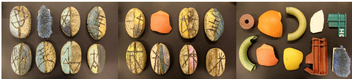
Photo series 3: Timo Jokela, 30 Years' Walk at Varangerfjord , 2018, installation: found objects, cork and plastic (600 × 60 × 30 cm).