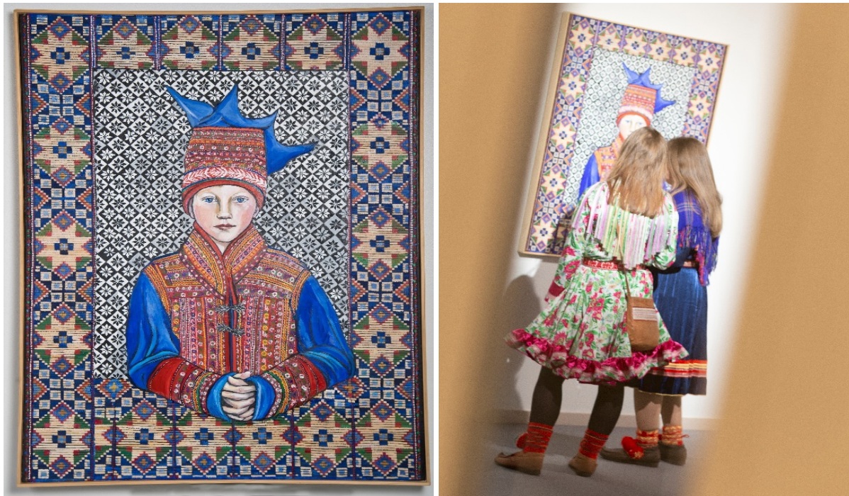
Photo series 2: Alison Aune, Sky , 2016, acrylic and paper on canvas, 91 cm x 121 cm.

I am not only exploring my cultural roots, but I am keeping the imagery alive by re-contextualising these ancient forms into a new artistic form that explores the intersection of women's material culture, craft and heritage (Huhmarniemi et al., 2019: 8).