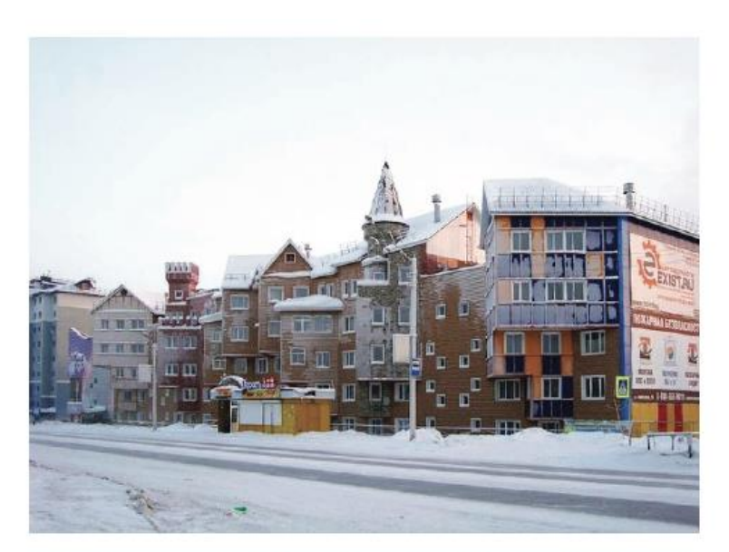
Puc. I-1. Жилой дом по ул. Советской, 98: пример трансформации недостроенного панельного пятиэтажного здания

The book is formed as a collection of case studies. For the task of "loading" the reader into the