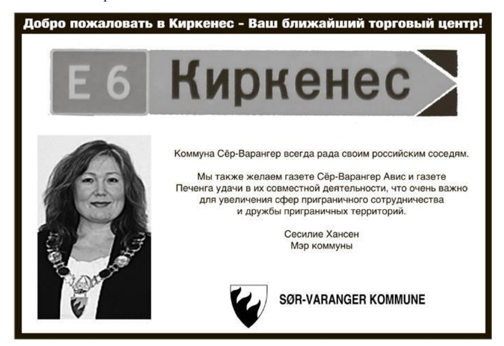
Figure 2 - A Sør-Varanger community ad in the Pechenga district's newspaper: Welcome to Kirkenes – your nearest shopping center!

Branding/PR strategies : In order to attract foreign investors and for twinning to gain both regional and national support, the municipalities have launched rather active PR campaigns. For example, they have arranged exhibitions, held the 'days of cooperation' and arranged festivals in towns with which they are related, taken part in international fairs and advertised themselves in the partner cities' mass media (see photograph below). In addition, the municipal leaders undertake regular trips abroad for public relations purposes. Kirkenes, Nikel and Pechenga run bilingual periodicals and web-sites oriented towards audiences in the regional neighbourhood. The main message of this campaign is to present twins as creative and innovative platforms rather than remote and depressive areas.